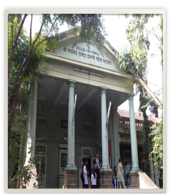
IOAC, SNDT ARTS AND COMMERCE COLLEGE FOR WOMEN, PUNE

NAAC accreditation and Assessment scores Cycle II: B Grade, CGPA 2.76 (September 2015)